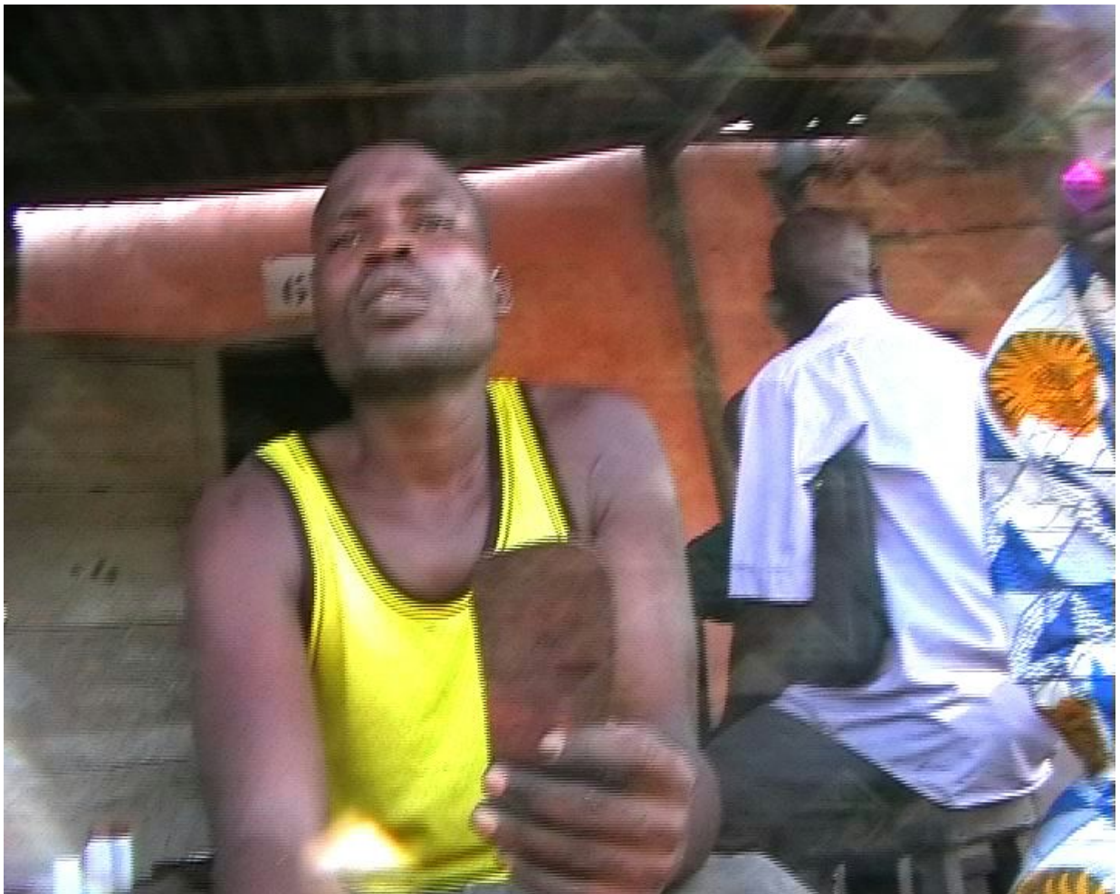
2007 Manufacturing a Copperplate from printmaking in Lomé, Togo.