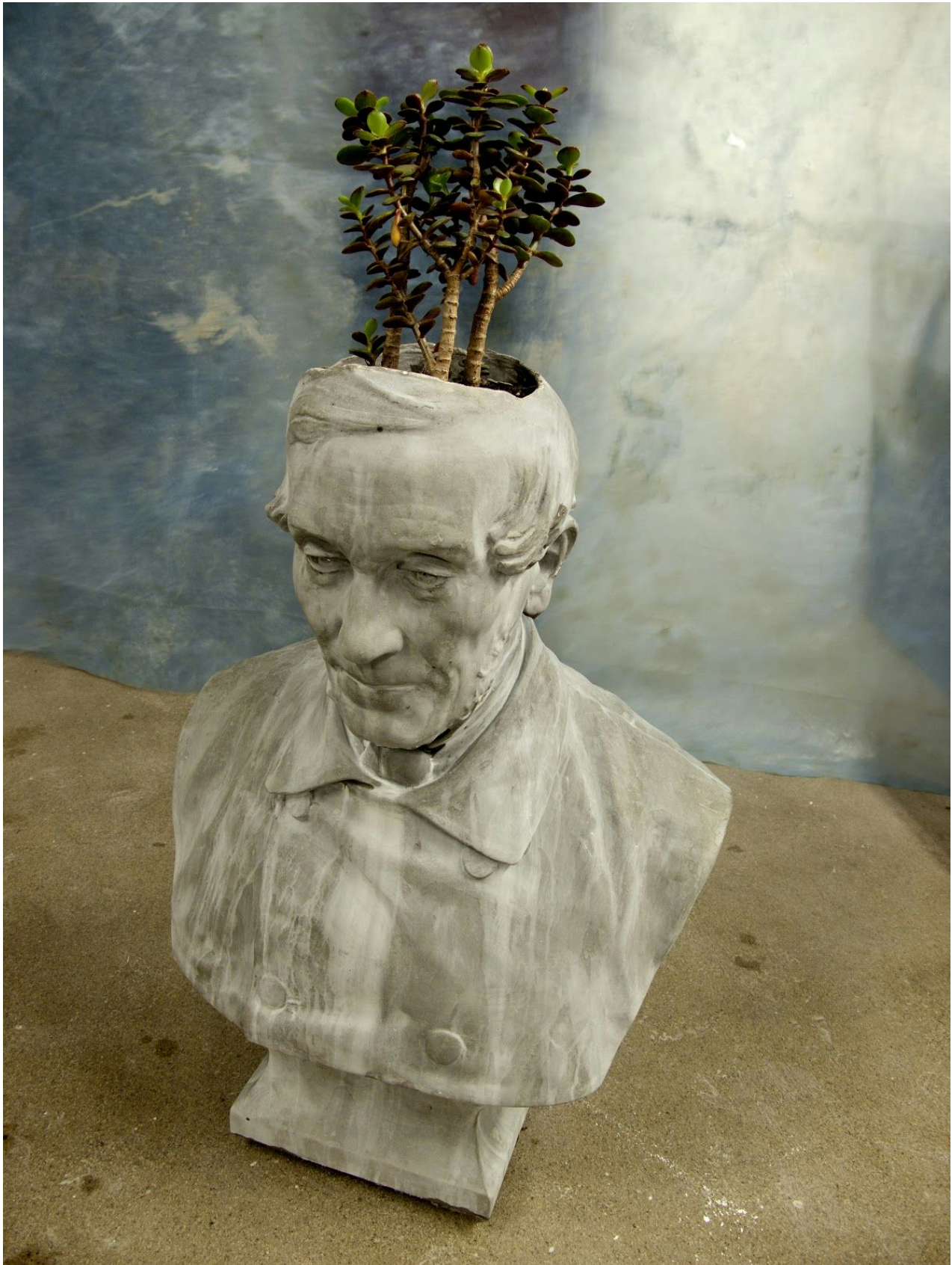
2013 Public Artwork Seli-seli seppel / Bla-bla Wreath (detail) Akaan Gymnasium ja Toijala Co-Educational. Akaa