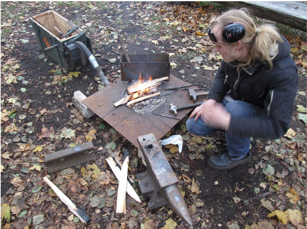
2010 Smithing in Public Spaces . Blacksmith workshop for Helsinki Public School, Helsinki

During the "Introduction to Blacksmithing" workshop participants were guided to the practice smithing and while engaging in talks concerning the role crafts in contemporary life. The workshop was organized for Public School Helsinki. No prior skills was required and each participant was guided to forge a knife. Forging by hand, using heat, hammers and anvils is the most robust ways to work with metals. The most complexed metal items known to day can still be made by hand.