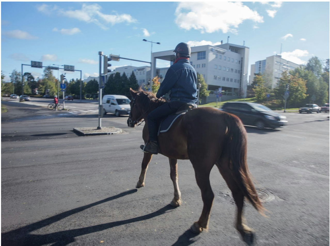
2014 Trans-Horse. Turku to Helsinki on Horseback. Finland Proper - Uusimaa