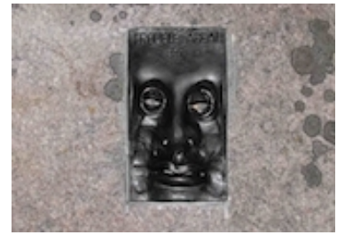
Send "The Message" to the year +2500CE.

Autumn Greetings from the NO-CHAIR-DESIGN Campaign! Only one more newsletter will be send after this, so if you want to stay in touch with Ore.e Refineries in the future, please subscribe to the regular company newsletter.